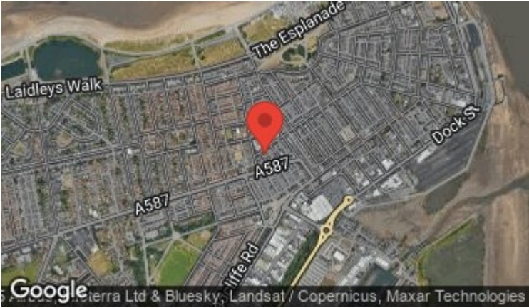
First Floor Flat 123 Blakiston Street